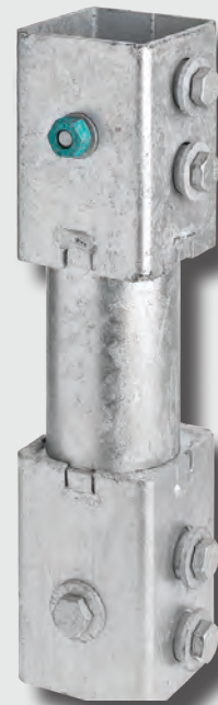
OMNI-DIRECTIONAL HINGE ASSEMBLY