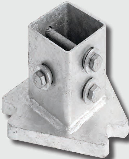
REDI-TORQUE SLIP BASE SYSTEM

The Omni-directional hinge assembly for multiple posts assists the structure in moving out of the way of a vehicle caused by an impact and helps reduce damage to the sign panel and vehicle.